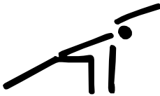
utthita parsva konasana