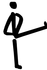
uthita hasta padangushtasana